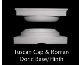
Tuscan Cap & Roman Doric Base/Plinth

All weights are approximate. * Manufactured from polyurethane.